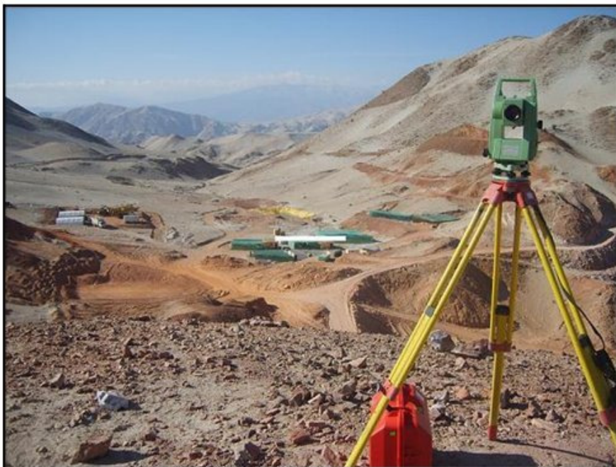
Figure 1 - View north-west across exploration camp at Los Calatos.