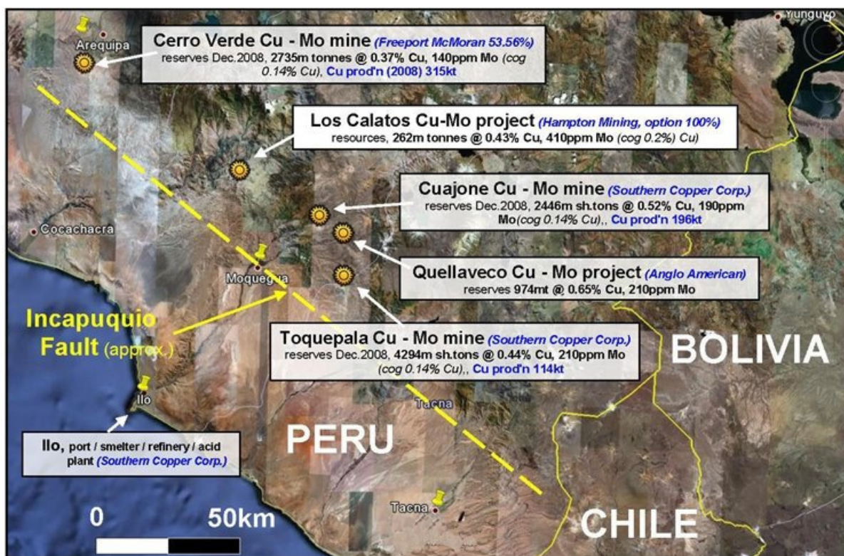
Figure 2 - Satellite Image of Los Calatos showing relationship to other deposits in the area