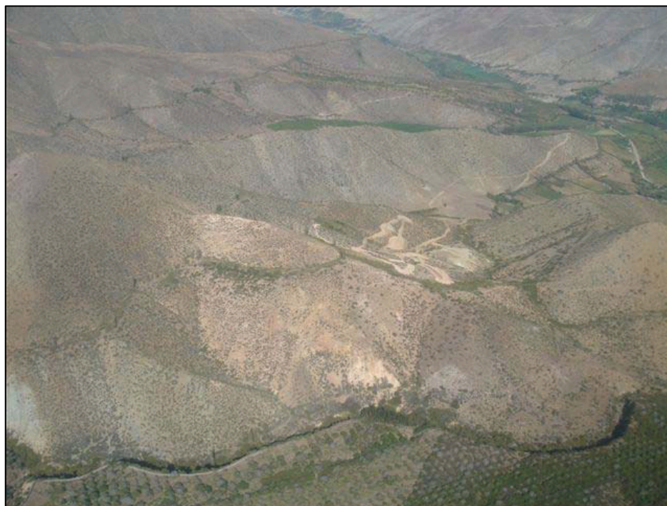
Figure 2: Mollacas Cu–Au–Mo porphyry (light colour reflects alteration of the porphyry at surface)