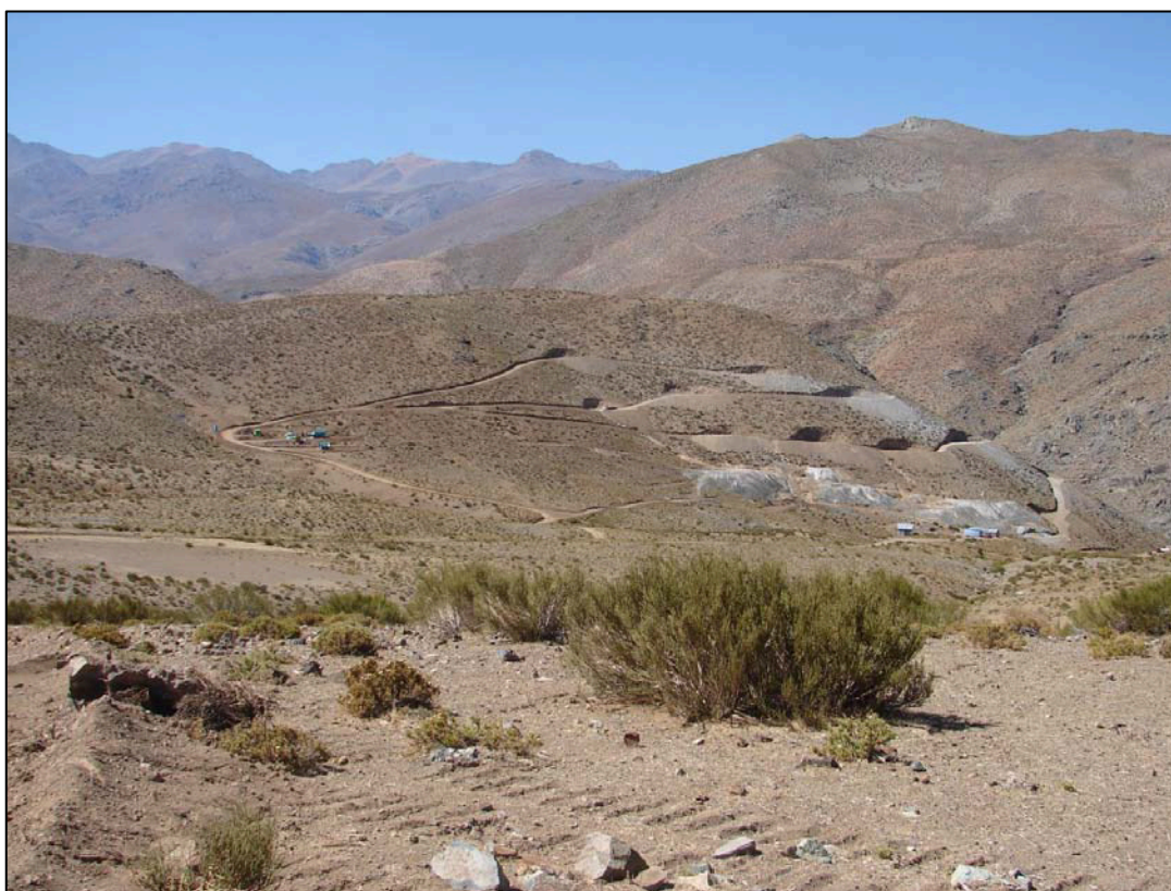
Figure 1: Old workings and drill pads at the La Colorada deposit, Vallecillo